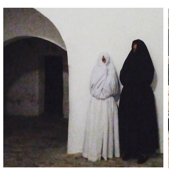
Find the 7 differences