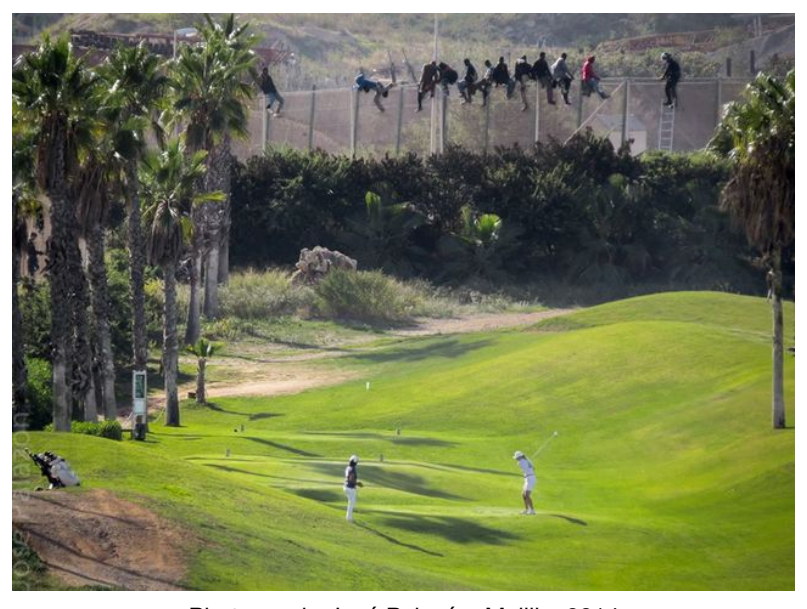
Melilla, 2014